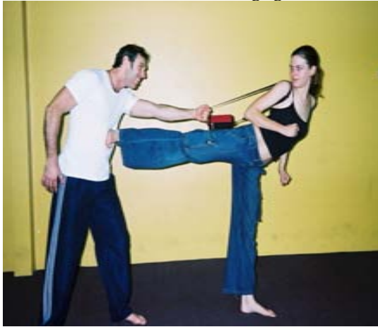
Side-Kick to 'hand bag' grab