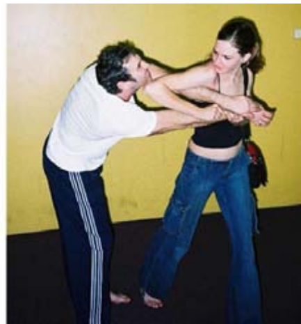
'Release' from 'choke-hold '

You may of course join our FREE STYLE tae kwon Do Classes and take up a more serious commitment to Your self-defence training is you so choose .