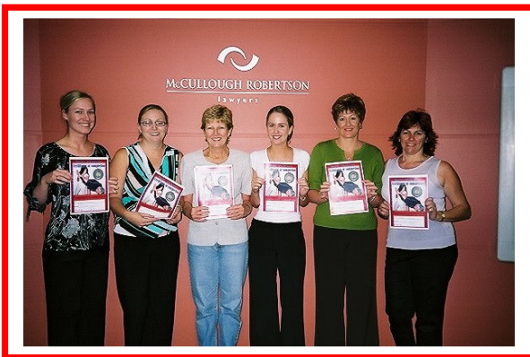
Ladies with awards at Corporate ladies Self-Defence