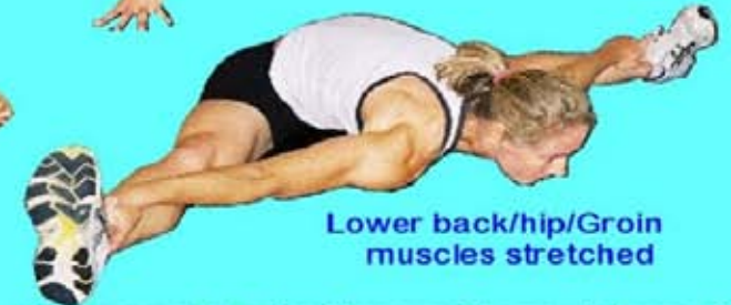
Lower back/hip/Groin muscles stretched

The Healy's Martial Art system explains the difference and why!