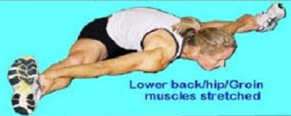
Lower back/hip/Groin muscles stretched