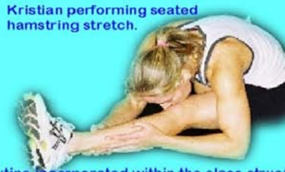
Kristian performing seated hamstring stretch.